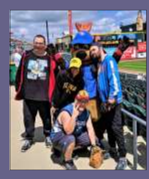
One of the Day Hab groups' favorite activities this summer was to attend some I-Cubs baseball games. We had a lot of fun!