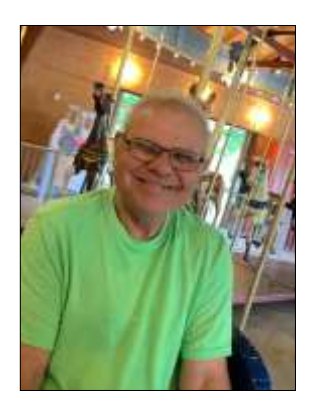
Story City Carousel